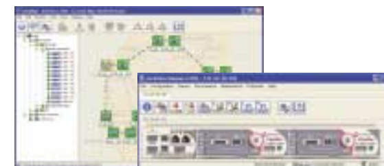
PolyView and CeraView screens

PolyView™ is Ceragon's NMS server that includes CeraMap™, its friendly yet powerful client graphical interface. PolyView can be used to update and monitor network topology status, provide statistical and inventory reports, define end-to-end traffic trails, download software and configure elements in the network. In addition, it can integrate with Northbound NMS platforms, to provide enhanced network management.